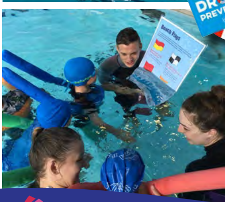
Learning the flags