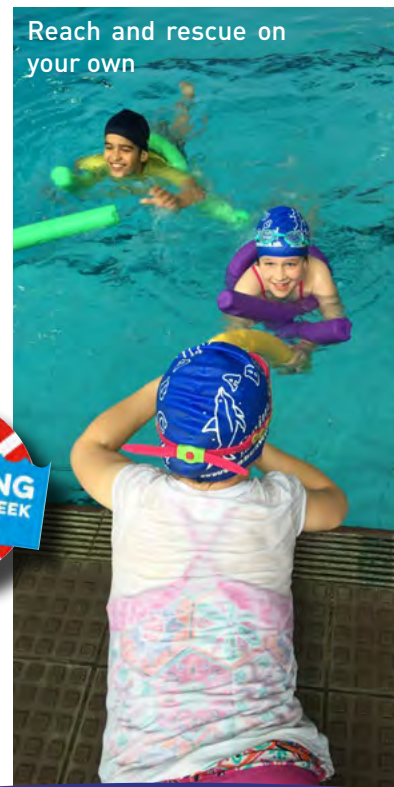
Reach and rescue on your own