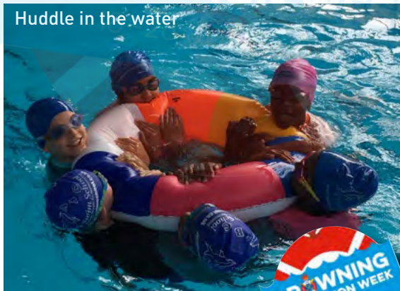
Huddle in the water